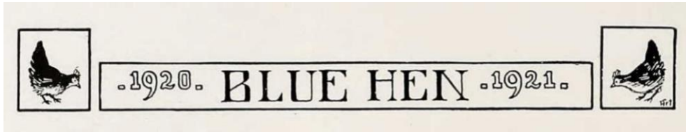
Yearbook entry, 1921, Delaware College (University of Delaware), Newark, DE