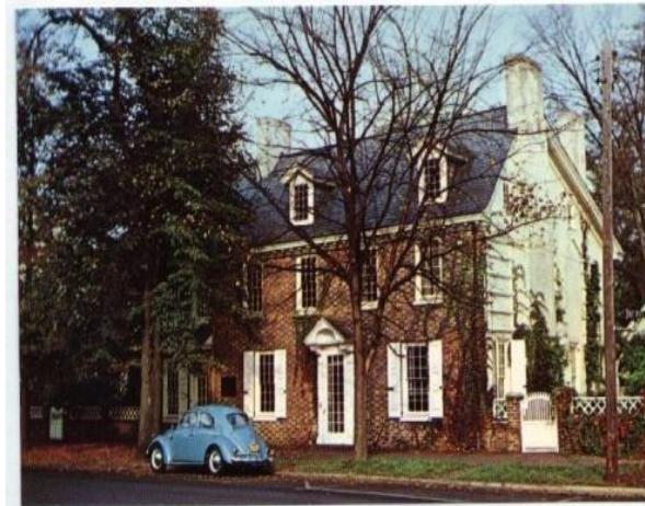
Ridgely home on The Green, Dover, DE