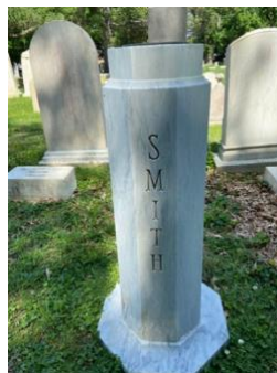
Sundial in 201

STYLE: Tall monument with cross at the top