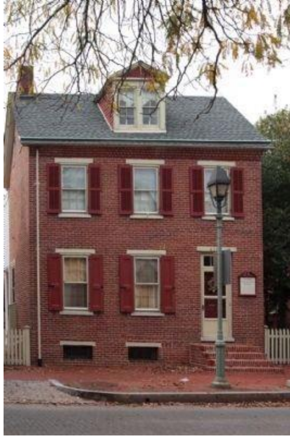
420 S. State St., Dover DE