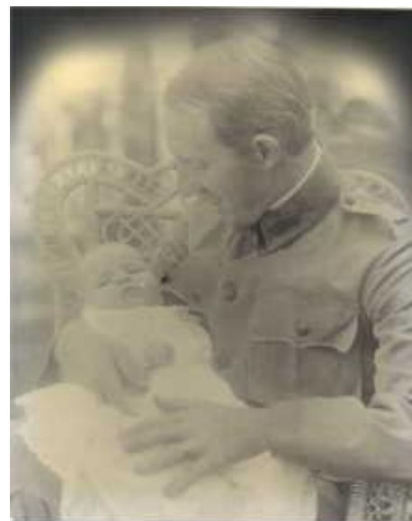
Baby photo with father