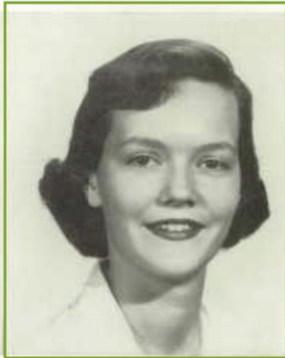
1953 St. Catherine's School, Richmond, VA yearbook

Vivid talker Interesting eyes Capable K nits constantly Yearns for England